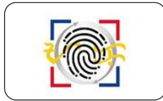
· Philippines Philsys