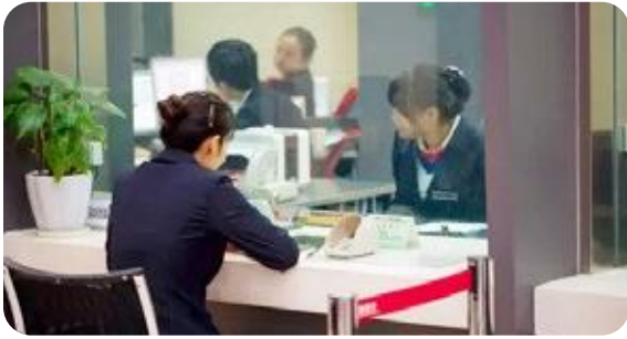
· Finance and Banking