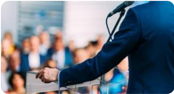
· Vote election/Govt. ID Authentication