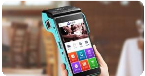
· Point of Sale