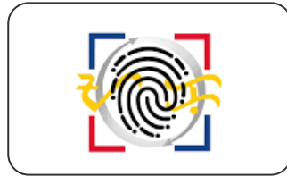
· Philippines Philsys